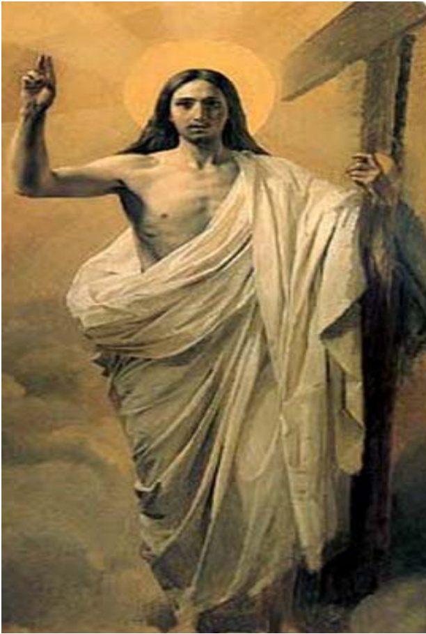
Table Prayer for the Season of Easter